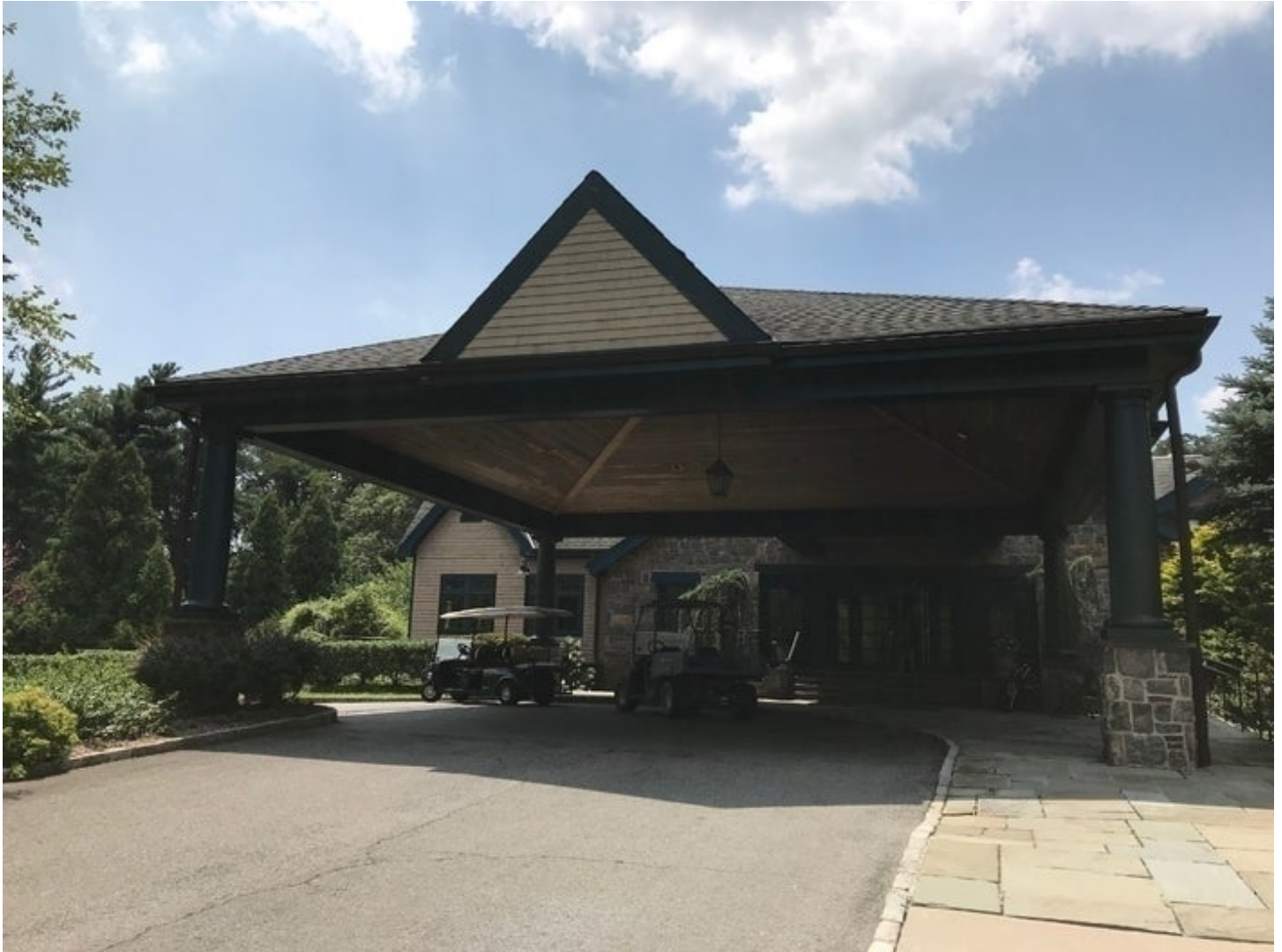
The developer of The Residences at Hampshire is suing the village for turning down an application.

MAMARONECK, NY — The developer of a proposed residential project in Mamaroneck has sued the village and planning board to reverse a decision that denied its application to build homes on its 106-acre property. Hampshire Recreation LLC filed the suit Tuesday in New York State Supreme Court in White Plains.